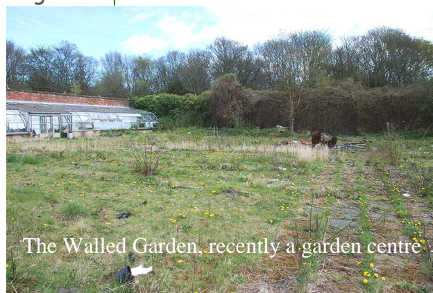
The Walled Garden, recently a garden centre

The house has long since gone, but there are plans to build a huge greenhouse on the footprint of the house, and to plant an arboretum and learning centre within the grounds. The entrance will be through the original 10 acre walled Victorian kitchen garden, which will form the beating heart of the new development. This is a very exciting coup for the area winning the opportunity from a potential field of 20 possible sites. With our Society's affiliation to the RHS we will be able to have free trips for up to 50 members at a time - and only 3 years to wait!